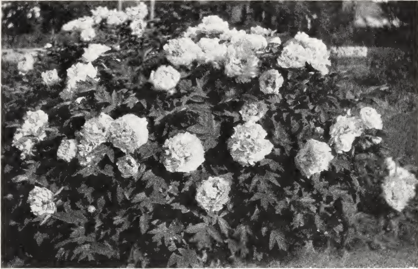
PÆONIA ARBOREA (Tree Peony) BANKSI , 10 years old, on its own roots, 4 feet high, 15 feet in circumference, bore 125 double, flesh-pink flowers in 1929.—Oberlin Peony Gardens, Sinking Spring, Pa.